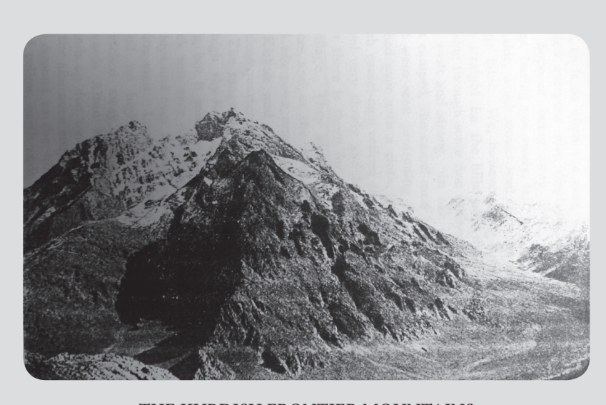
THE KURDISH FRONTIER MOUNTAINS