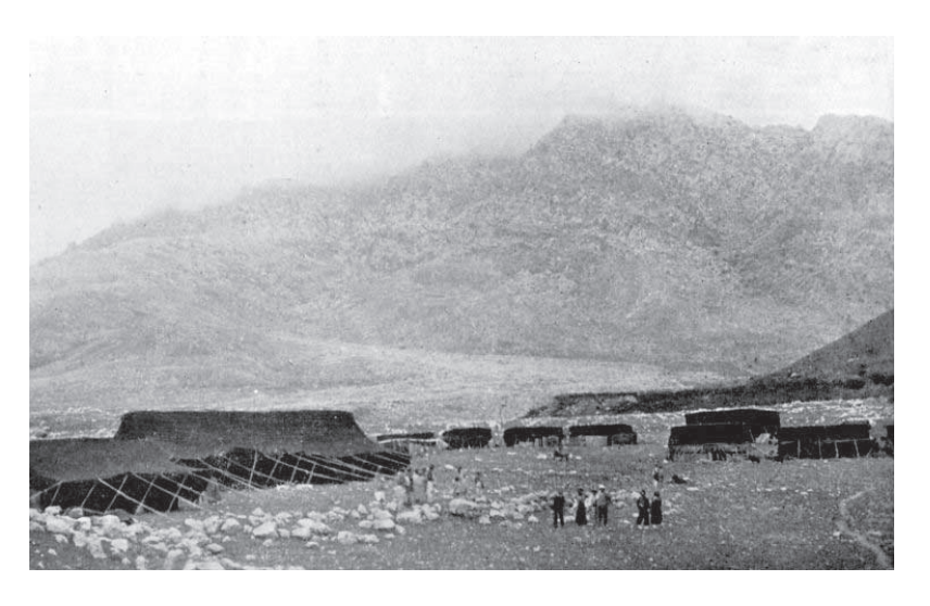
ENCAMPMENT OF JAF KURDS IN SHAHR-I-ZUR

The tribe seldom passes the Persian frontier, except at its northern migration limit near Bana, for over their southern border lies the territory of the Guran, an ancient and renow-