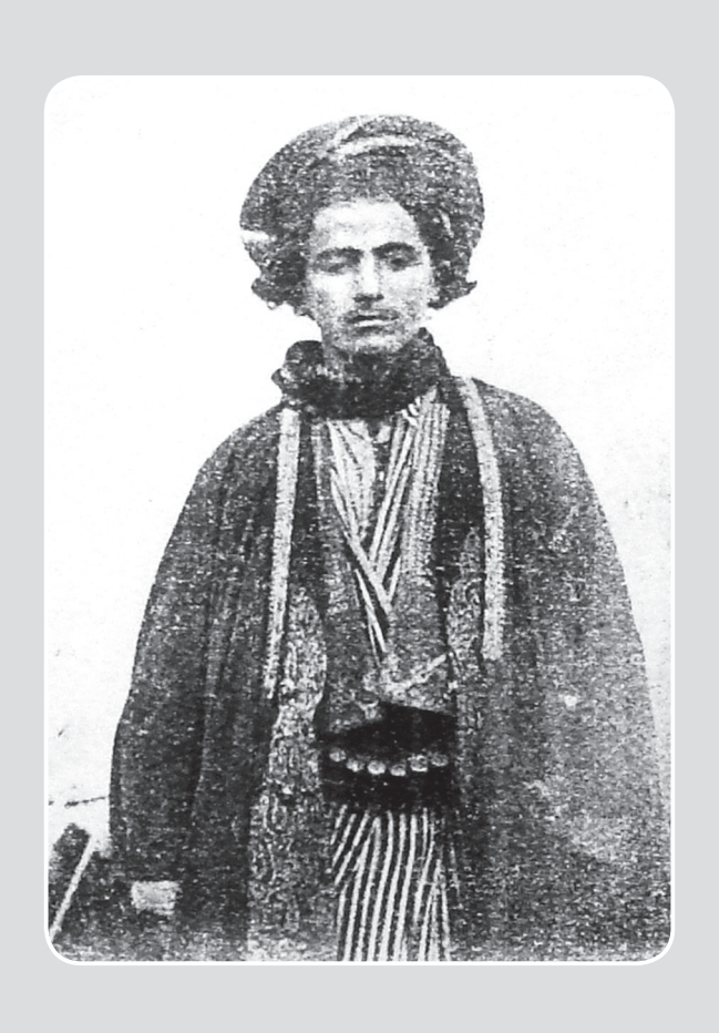
A JAF CHIEF, SOUTH KURDISTAN