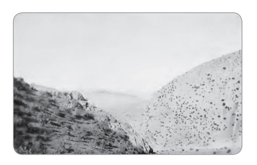
ON THE PERSIAN FRONTIER, S. KURDISTAN

The fasts and feasts are extremely numerous, and all Chaldeans — Roman Catholic, Orthodox, or otherwise — are extraordinarily strict in the observance of such days in their respective sects, besides being very strict Sabbatarians.