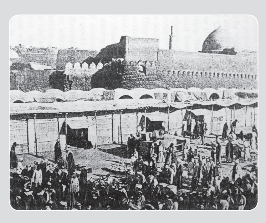
BAB-UL- TOP AND AUCHAN MARKET, MOSUL